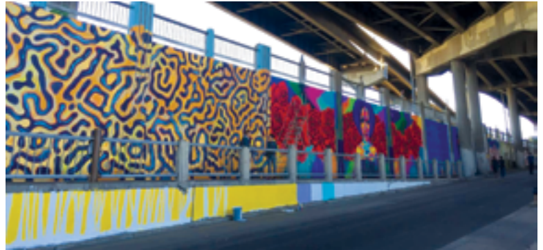
URBAN ARTS FUND