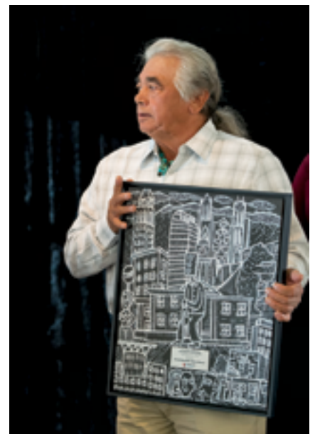
MAYOR'S AWARDS FOR EXCELLENCE IN ARTS & CULTURE