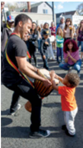
FIVE POINTS JAZZ FESTIVAL