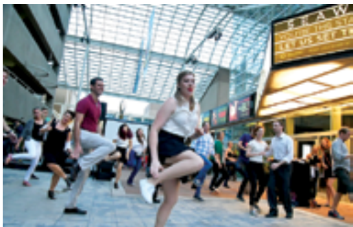
COUNCIL DISTRICT CULTURAL MAPPING