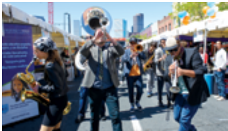
THE NEXT STAGE NOW