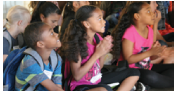
YOUTH ONE BOOK, ONE DENVER